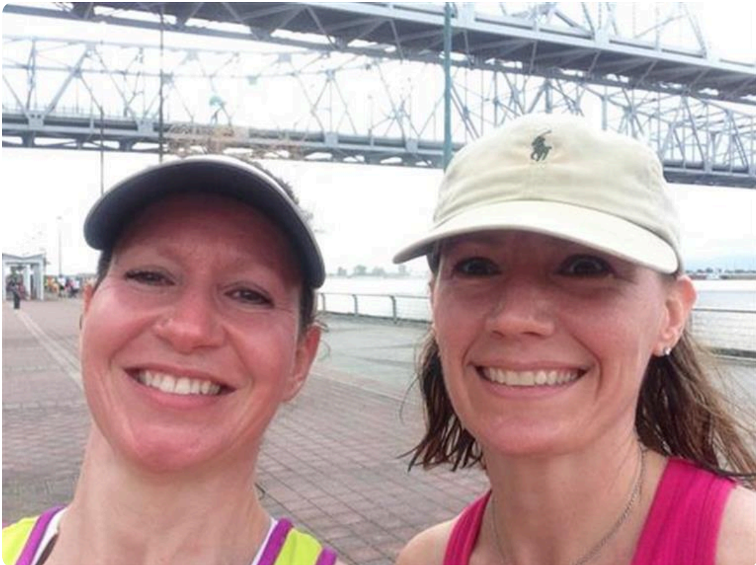
Crescent City Connection Bridge Run June 2013