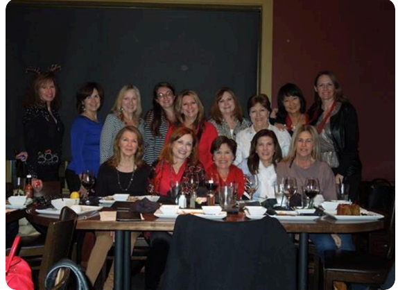
Jazzercise Christmas Dinner 2014