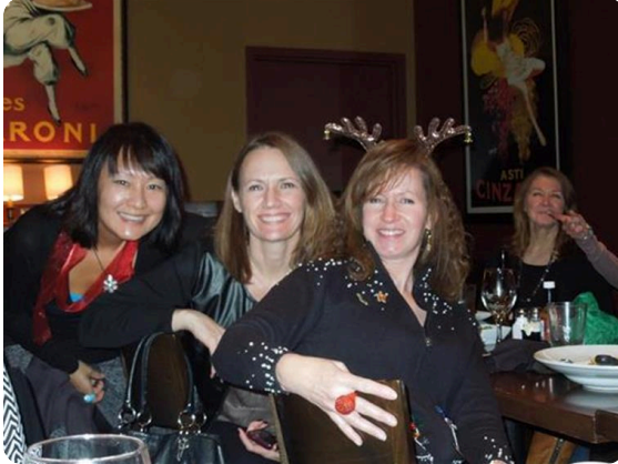
Jazzercise Christmas Dinner 2014